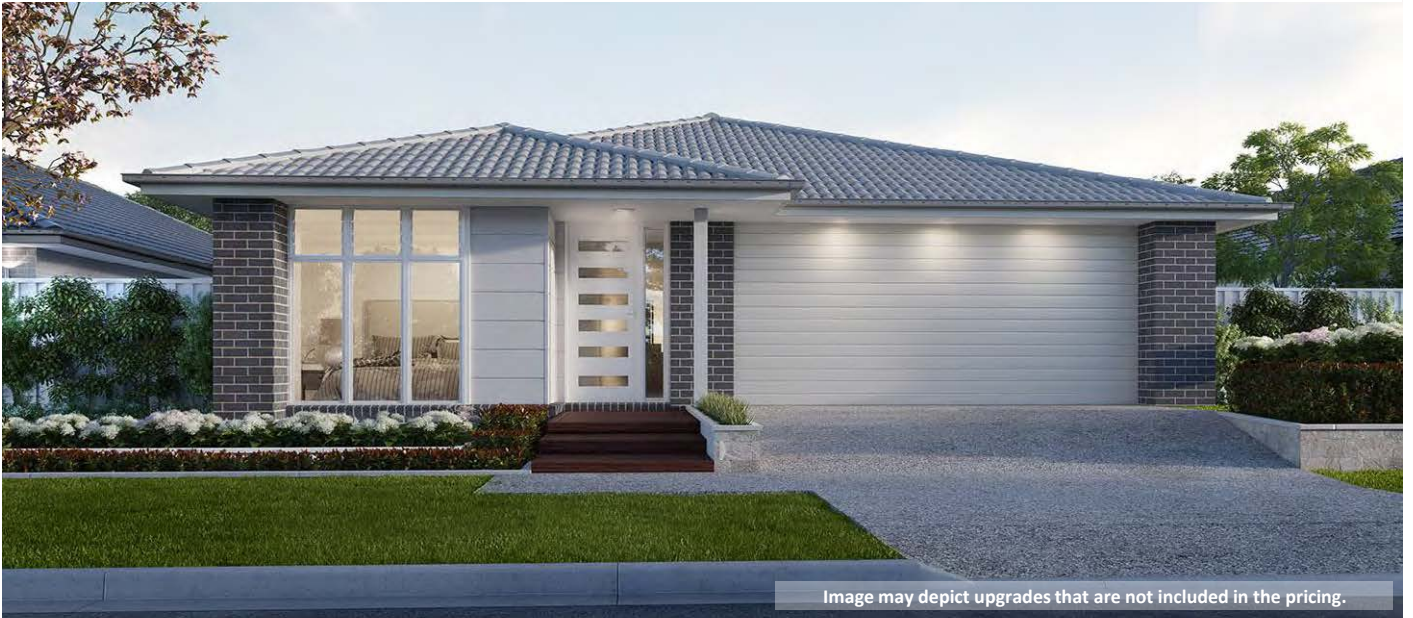
Image may depict upgrades that are not included in the pricing.

Floor area: 207.29m 2 / 22.31sq | Block Size: 970m 2 Address: Lot 815 Yeomans Road, Armidale 2350