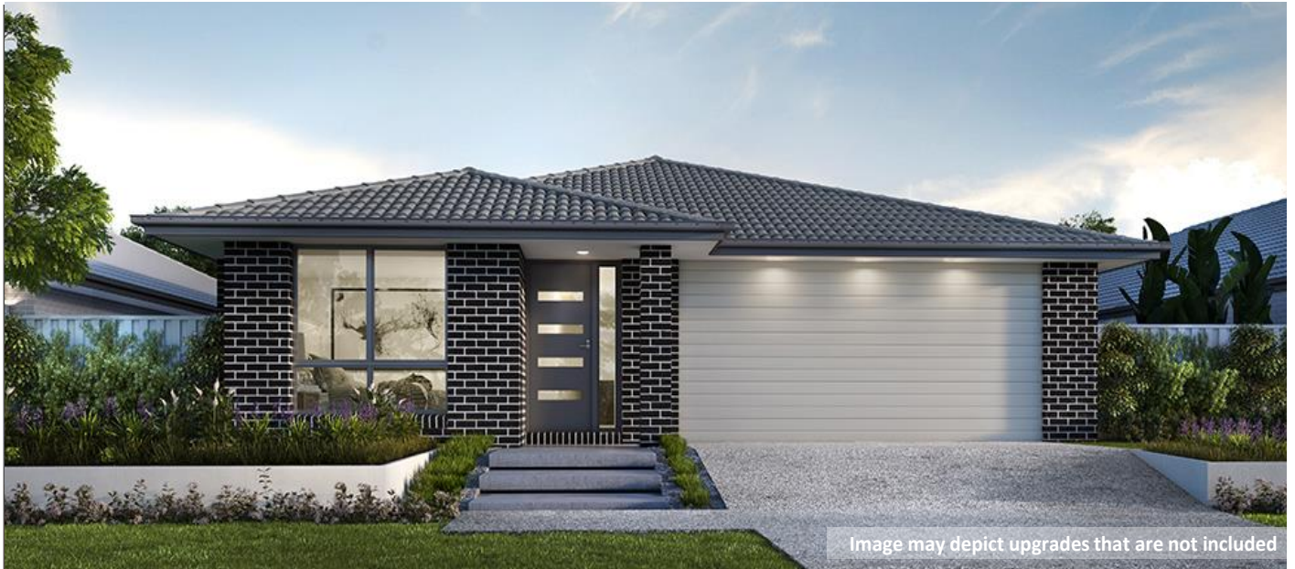
Image may depict upgrades that are not included

Floor area: 240.94m 2 / 25.94sq | Block Size: 900m 2 Address: Lot 804 Yeomans Road, Foothills Estate, Armidale 2350