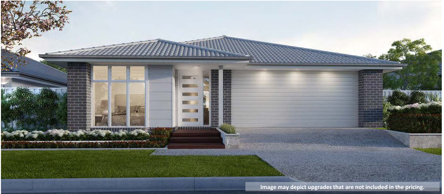
Image may depict upgrades that are not included in the pricing.

Floor area: 10.11m 2 / 216.62sq | Block Size: 1370m 2 Address: Lot 710 Yeomans Road, Foothills Estate, Armidale 2350