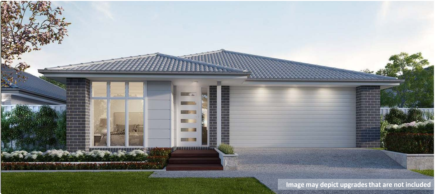
Image may depict upgrades that are not included

Floor area: 201.01m 2 / 21.64sq | Block Size: 1031m 2