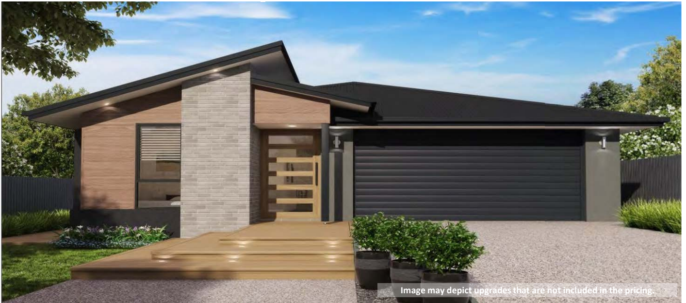
Image may depict upgrades that are not included in the pricing.

Floor area: 222.32m 2 / 23.93sq | Block size: 1031m 2 Address: Lot 706 Yeomans Road, 'The Foothills Estate', Armidale